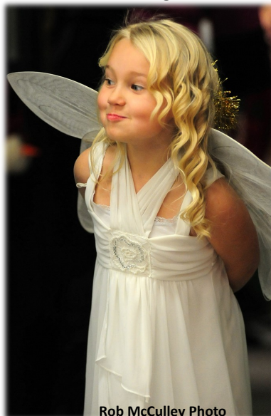
Rob McCulley Photo